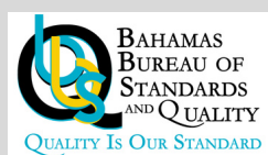
Bahamas Bureau of Standards & Quality