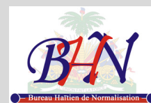
Haiti Bureau of Standards