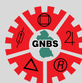
Guyana National Bureau of Standards