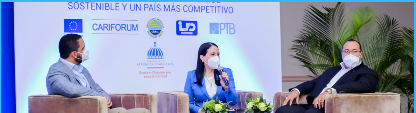
INDOCAL hosted a Quality Symposium to focus on the work it is doing in the 11th EDF TBT Programme.

Regional cooperation is of vital importance to boost technical and financial support for both public and private policies in a nation. The unity of efforts between national and regional organizations increases the provision of equipment, supplies, as well as advice and training. Factors that strengthen the purposes where they are applied, and in this particular case, are fundamental for the promotion of the Dominican Quality Infrastructure.