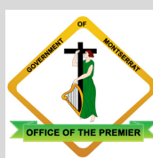
Montserrat Trade & Quality Infrastructure Division