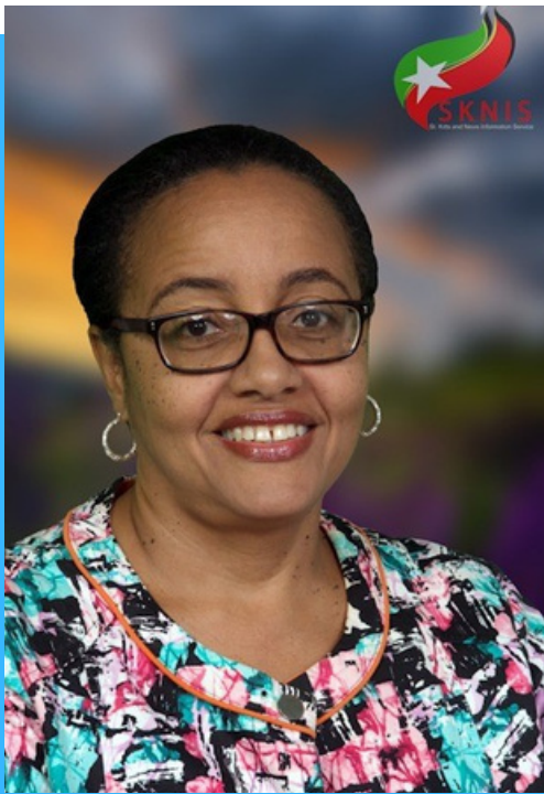
Minister of International Trade, Industry, Commerce, Consumer Affairs & Labour, Hon. Wendy Phipps.