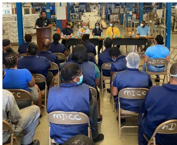
Staff were on hand to witness the occasion.